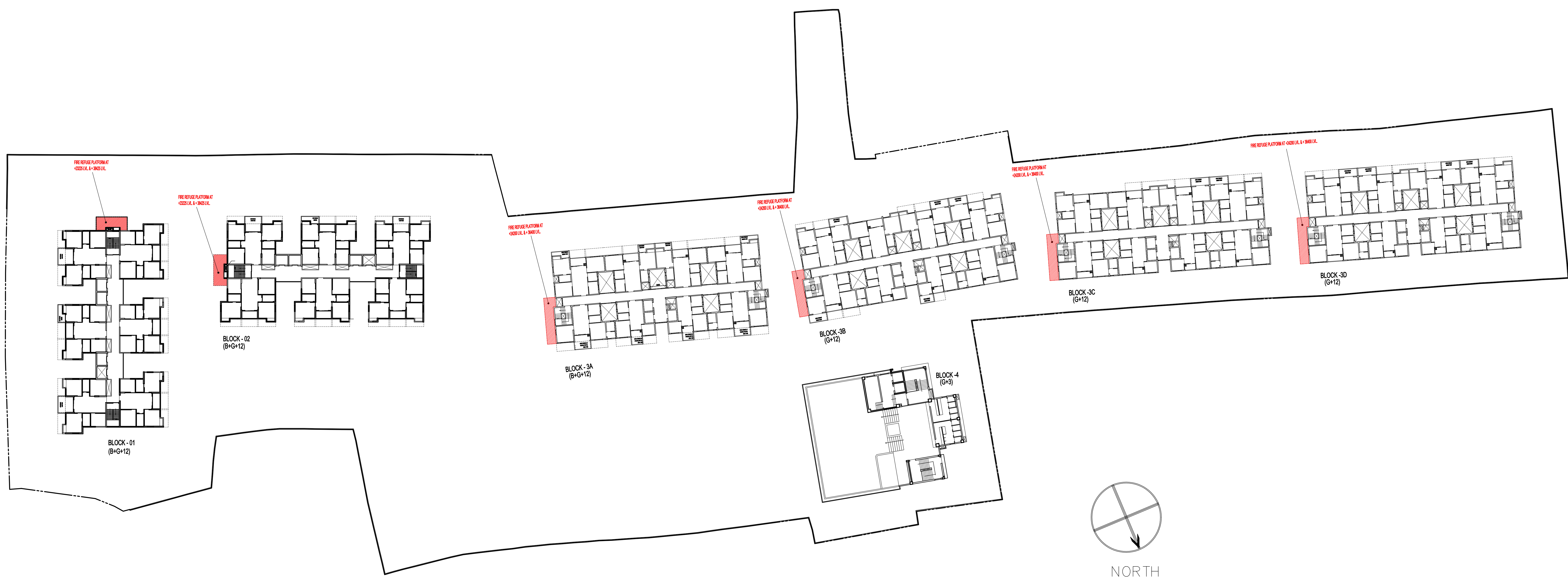
FIRE REFUGE FLOOR PLAN

PROJECT REVISED PLAN PROPOSAL FOR B+G+XII(BLOCKS 1,2,3A), G+XII(BLOCK3B,3C,3D) & G+III(CLUB-BLK.4) STORIED (40 MTS HEIGHT) RESIDENTIAL BUILDING UNDER MOUZA CHAPNA, JL NO 35, R.S./ L.R DAGNO.-143,144(P),146,149,152(P),153,154,155,156,157, 258,259,260,261,262,263,264(P), 265(P),266(P),267(P),268,270(P),271,275,276,277,280 . UNDER PATHAR PPGHATA GRAM PANCHAYAT, P.O. & P.S. RAJARHAT NORTH 24 PARGANAS, KOLKATA - 700135. SUPERSEDING PREVIOUS MEMO NO. 8291/ NKDA/ BPS 04(53)/2020. DATED- 02 / 08 / 21.